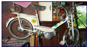
Moped (Not Titled)