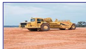
Construction/Farm Equipment (Not Titled)