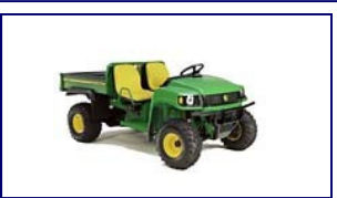
Utility Vehicles (Not Titled)